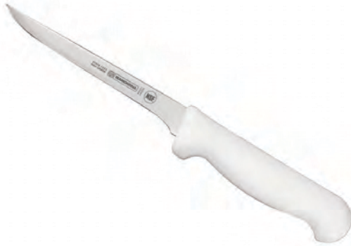
C462/06 – 6" (15cm) Narrow Stiff Boning