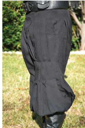
BKPP – Black Pants w/ pleats