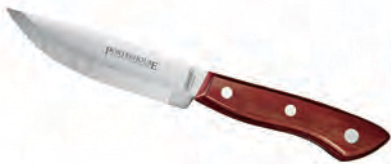
80000/110 Pointed Tip (Full Tang)