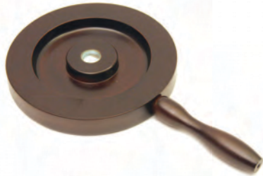
S1053 - W Wood