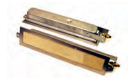
B15 Infrared Burner