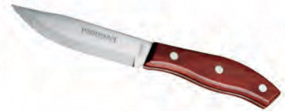
80000/100 Pointed Tip (Full Tang)