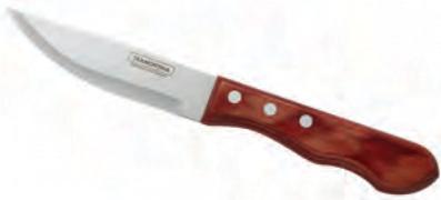
80009/110 Pointed Tip (3/4 Tang)