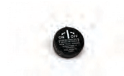
WR F42.0895 Knob for 764/742 Valve