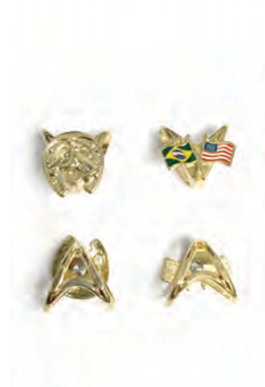
S1188 – Ring for Scarf - Horse Head S1189 – Ring for Scarf Flags