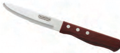
80009/105 Rounded Tip (3/4 Tang)