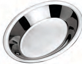
61402/200 – 20cm Oval Deep 61402/240 – 24cm Oval Deep