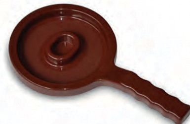
ROD Paddles Brown Plastic TSP