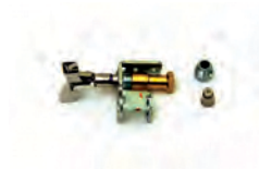
RS 1830.489 Pilot ASS's Y