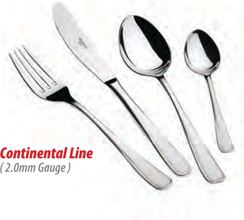
Continental Line (2.0mm Gauge)