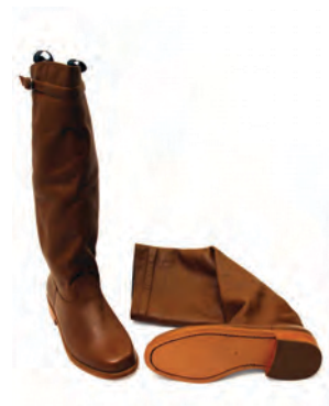
BRB – Brown Leather Boots