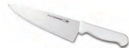
C469/08 – 08" (20 cm) Cook's Knife C469/10 – 10" (25 cm) Cook's Knife