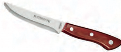
80000/111 Rounded Tip (Full Tang)