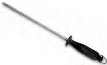
2440/10 10" (25 cm) Sharpener Steel