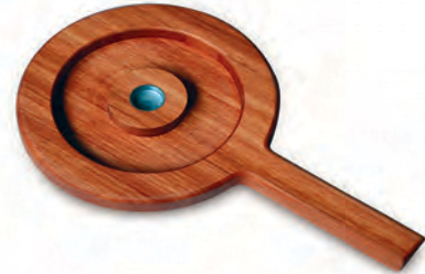
S1055 - WO Origin Wood