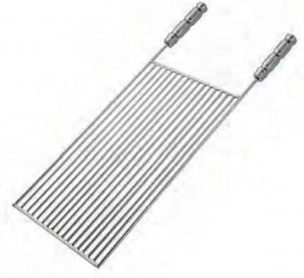
S1073 – Flat Grill . GCT- 450 (Standard 30cm x 55 cm)

“ For more information about other sizes, please consult us. ”