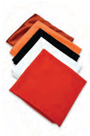
S1180 – Red Scarf S1181 – White Scarf S1184 – Black Scarf S1185 – Orange Scarf