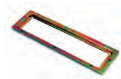
002.803 Frame for Burner