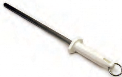
W3303/12 12" (30 cm) Sharpener Steel