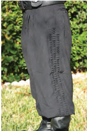
BKPF – Black Pants w/ combs

BUY DIRECT FROM BRAZIL BuyDirectFromBrazil.com