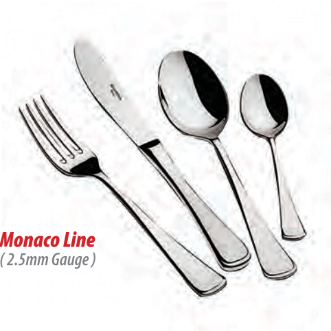
Monaco Line (2.5mm Gauge)