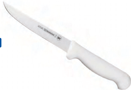
C463/06 – 6¼" (16 cm) Extra Wide Stiff Boning