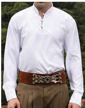
WHSH – White Shirt BKSH – Black Shirt