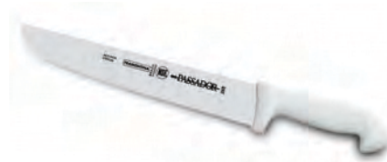
24420/088 – 08" (20 cm) Butcher Knife 24420/080 – 10" (25 cm) Butcher Knife