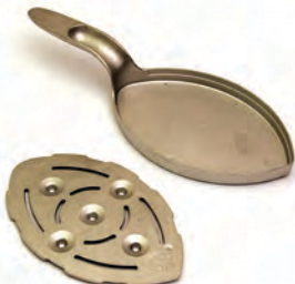
S1051 - A Aluminum