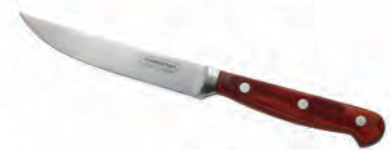
24021/005R Forged, Pointed Tip, Fine Edge