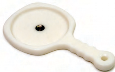
S1054 - P Polyethylene TSP