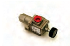
WR 764.742 1/2" Gas Safety Valve