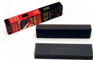
S1061 Double Sharpening stone