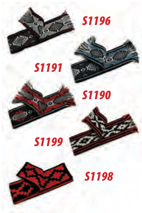
S1196 – Inca White Sash S1191 – Inca Blue Sash S1190 – Inca Red Sash S1199 – Pampa Red Sash S1198 – Knit Red Sash