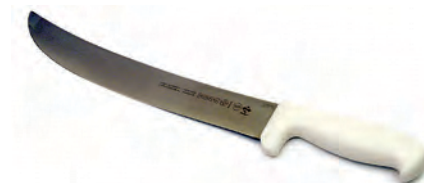
WS617/10 – 10" (25 cm) Cimeter Knife WS617/12 – 12" (30 cm) Cimeter Knife