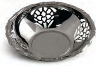
61452/221 – 8 ½" (21.5 cm) Pierced Basket