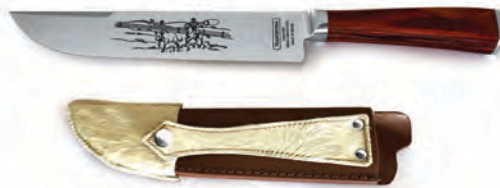
80015/504 7" Gaucho Knife w/ Leather Sheath