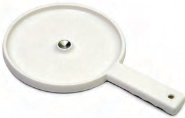
S1052 - P Plastic