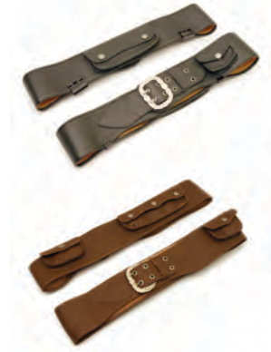
BKBE – Black Leather Belt BRBE – Brown Leather Belt