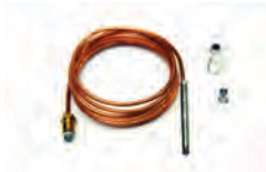
RS 1980.072 72" Thermocouple