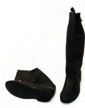
BKB – Black Leather Boots