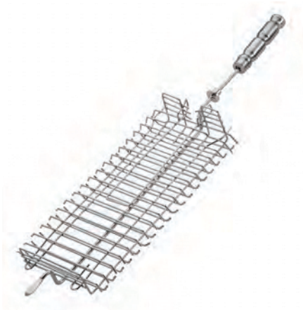
S1070 – Rotative Grill (Basket) (CR-BS)