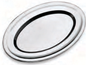
61400/200 – 20cm Oval Flat 61400/250 – 25cm Oval Flat

BUY DIRECT FROM BRAZIL BuyDirectFromBrazil.com