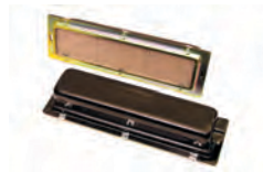
002.937 Infrared Burner