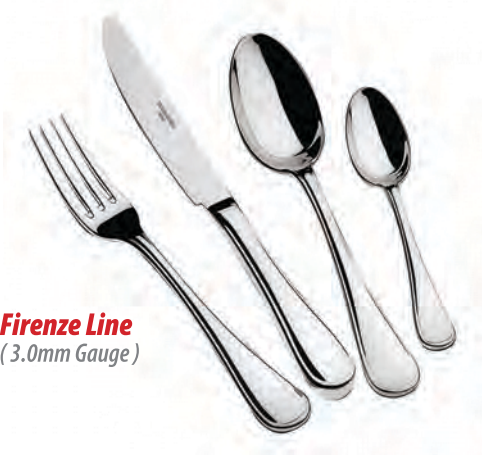
Firenze Line (3.0mm Gauge)