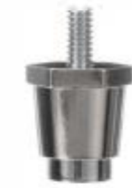
Item No.: ZG3551-1"