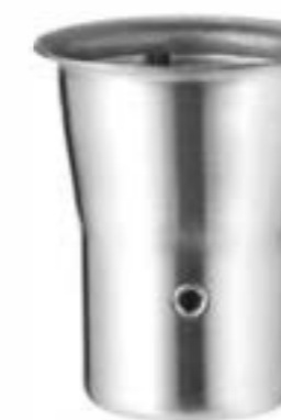
Item No.: J1411-80

Material: SS #201 / SS #304 Apply for \phi 41 mm round tube