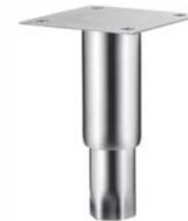
Item No.: A921