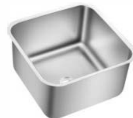
Item No.: MSB-02

Material: SS #201 / SS #304 Size: Customized