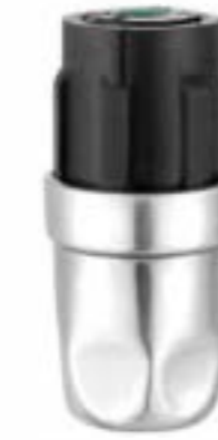
Item No.: DG1111-Y30

Material Grey Plastic Apply for \phi 25mm round tube