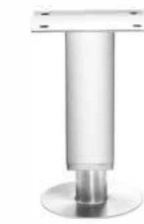
Item No.: F2121-F40(L)

Material: Stainless steel + Zamak Bottom: 41mm square bullet foot insert