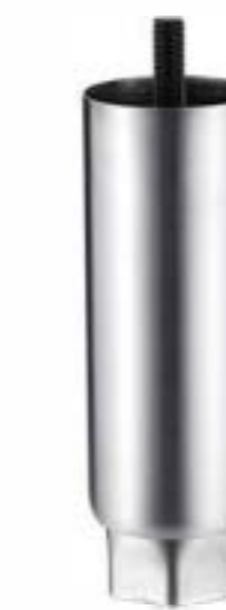
Item No.: A951

Material: SS201/SS304 Tubing: φ50.8+42mm