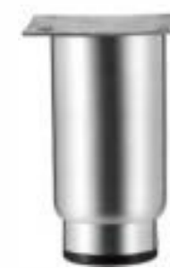
Item No.: A122

Material: SS201/SS304 Tubing: φ50.8+42mm