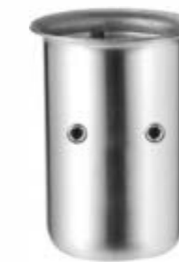
Item No.: J1212-80

Material: SS #201 / SS #304 Apply for \phi 41 mm round tube