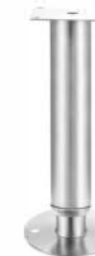
Item No.: F2111-Y41(L)

Material: Stainless steel + Zamak Bottom: 41mm round bullet foot insert