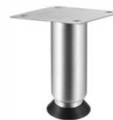
Item No.: A9310