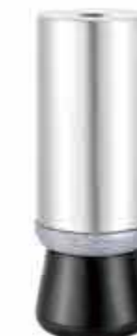
Item No.: DL2111-Y41

Material: Iron Bottom with SS #201 or #304 clad Apply for \phi 41mm round tube