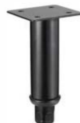
Item No.: D2011-Y38(L)

Material: Stainless steel + Zamak Bottom: 51mm round bullet foot insert