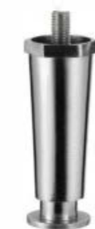
Item No.: Z7552-02

Material: Nylon Body and Zamak Bottom Height: 4"(100mm)