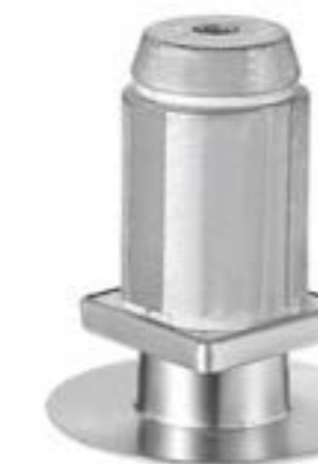
Item No.: F2221-F51(89)

Material: Zamak Bottom with SS #201 or #304 clad Apply for 51*51mm square tube