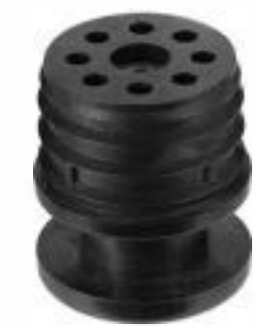
Item No.: FG1021-Y50

Material: Plastic Size: \phi 50mm round tube