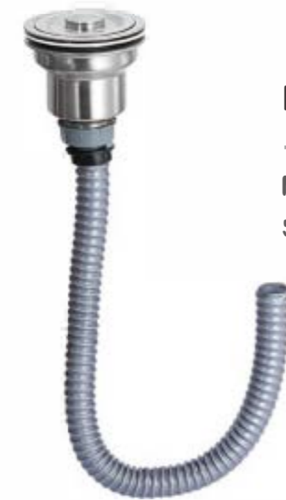
Item No.: SSD-08