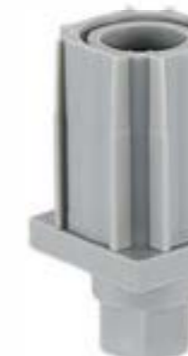
Item No.: DG1016-F40

Material: Grey Plastic Apply for 35*35mm square tube