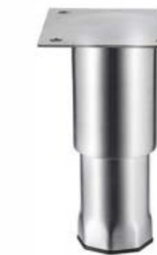
Item No.: A11215.5