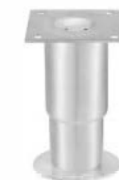
Item No.: A13114

Material: SS201/SS304 Tubing: φ50.8+42mm