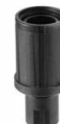
Item No.: DG1011-Y43(L)

Material: Iron Rubber Apply for \phi 41mm round tube