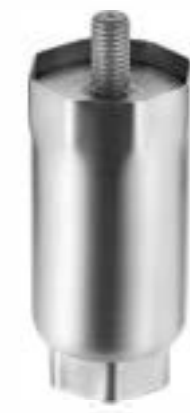
Item No.: A1(5+9)1

Material: SS201/SS304 Tubing: φ50.8+42mm