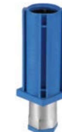
Item No.: D121X-F40(L)

Material: Blue Plastic Bottom with SS #201 or #304 clad Apply for 40*40mm square tube