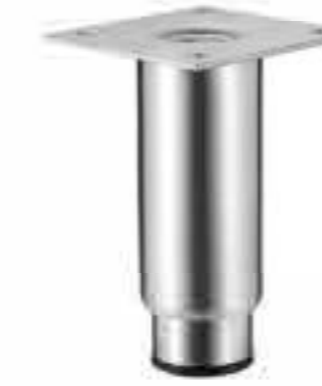
Item No.: A932

Material: SS201/SS304 Tubing: φ50.8+42mm