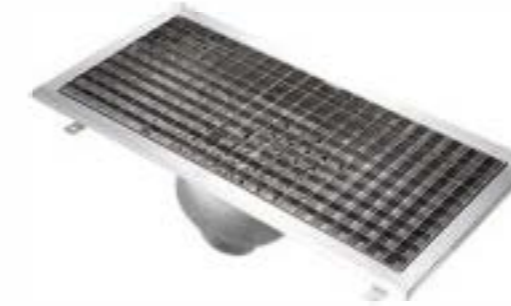
Item No.: BOOD-3060-1

Material: SS #201 / SS #304 Size: 30*30 mm