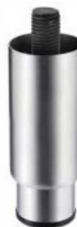
Item No.: A952