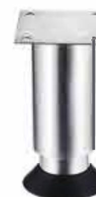
Item No.: A1310

Material: SS201/SS304 Tubing: φ50.8+42mm