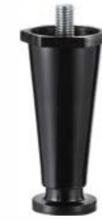
Item No.: Z3532