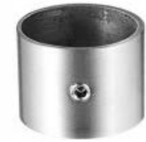
Item No.: J2111-30 / J1111-30

Material: SS #201 / SS #304 Apply for \phi 38/41 mm round tube