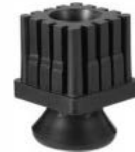
Item No.: FG1021-F40

Material: Plastic Size: \phi 50mm square tube