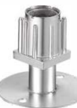
Item No.: F2212-F38(89)

Material: Zamak in Nickel Bottom with SS #201 or #304 clad Apply for 40*40mm square tube