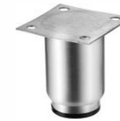
Item No.: A1122