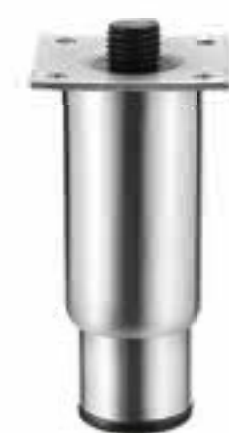
Item No.: A9(1+5)1