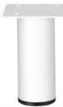
Item No.: FAL475