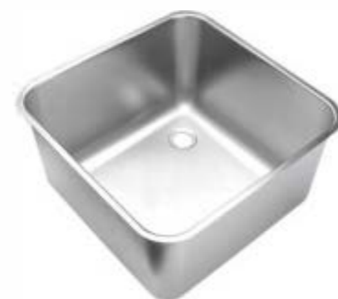
Item No.: MSA-01

Material: SS #201 / SS #304 Size: Customized