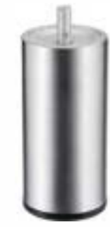
Item No.: A125201