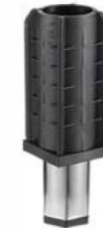
Item No.: D1211-F40(L)

Material: Aluminum in nickel Apply for 38*38mm square tube