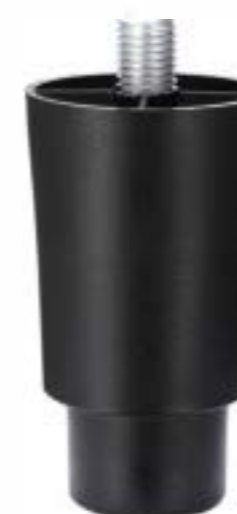
Item No.: ZG3533

Material: PP Bottom: with SS #201 or #304 clad Height: 100~120mm