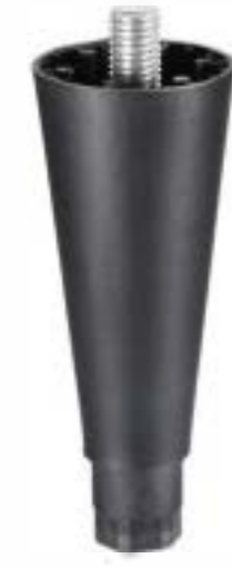
Item No.: Z3533