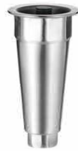
Item No.: Z2623-150

Material: Nylon Body and Zamak bottom Height: 6"(150mm)