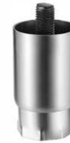
Item No.: A11515.6