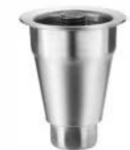
Item No.: Z2623-90

Material: stainless steel Height: 5"(120-150mm)