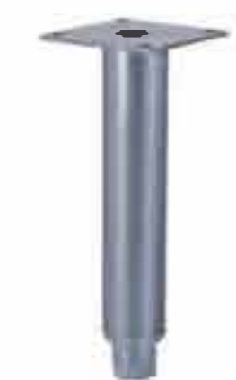
Item No.: D2016-Y38(L)

Material: Iron with Black painting Bottom: 38mm round bullet foot insert