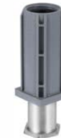
Item No.: D1216-F40(L)

Material: Zamak Bottom with SS #201 or #304 Flange Apply for 51*51mm square tube