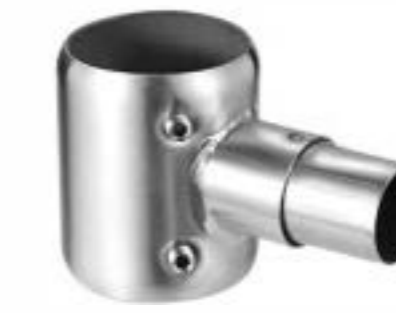
Item No.: T1111 / T1311

Material: SS #201 / SS #304 Apply for \phi 38/41 mm round tube