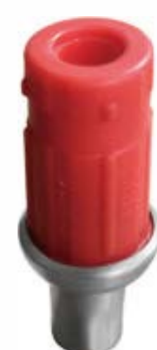
Item No.: D1119-Y38

Material Grey Plastic Bottom with SS #201 or #304 clad Apply for \phi 38mm round tube