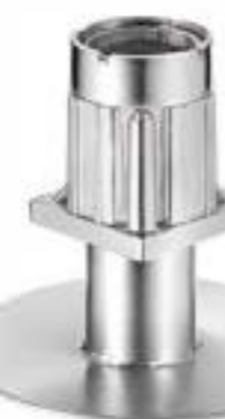
Item No.: F2222-F40(89)

Material: zamak in nickel Bottom with square flange Apply for 40*40mm square tube