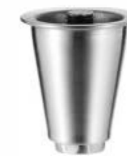
Item No.: Z1623-90

Material: stainless steel Height: 5"(120mm)