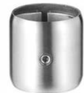
Item No.: J2311-50 / J1311-50

Material: SS #201 / SS #304 Apply for \phi 38/41 mm round tube