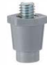
Item No.: ZG3533-1"