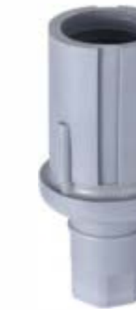
Item No.: DG1016-Y41

Material Black Plastic Apply for \phi 41mm round tube