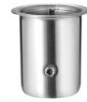
Item No.: J2211-60 / J1211-60

Material: SS #201 / SS #304 Apply for \phi 38/41 mm round tube