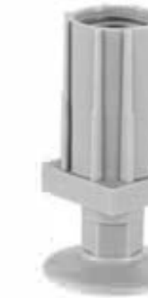
Item No.: FG1016-F30

Material: Grey Plastic Apply for 30*30mm square tube