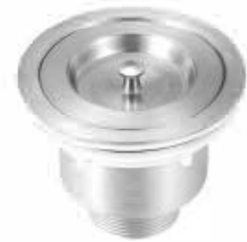
Item No.: SSD-01