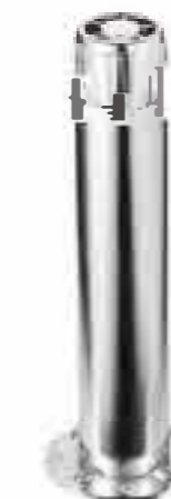
Item No.: FAL85

Material: Stainless steel + Plastic Bottom: 41mm square bullet foot insert