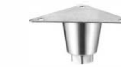
Item No.: ZG113122-2"

Material: stainless steel Height: 95-120mm