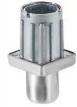
Item No.: D2111-F38

Material: Zamak Bottom with SS #201 or #304 clad Apply for 38*38mm square tube