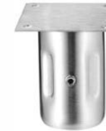
Item No.: J1601-80

Material: SS #201 / SS #304 Apply for \phi 41 mm round tube