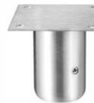
Item No.: J2511-80 / J1511-80

Material: SS #201 / SS #304 Apply for \phi 38/41 mm round tube