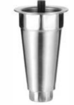
Item No.: Z2523-120

Material: stainless steel Height: 6"(150-180mm)