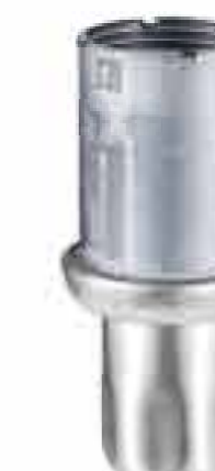
Item No.: D2111-Y41

Material Zamak Bottom with SS #201 or #304 clad Apply for \phi 38mm round tube