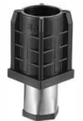
Item No.: D1211-F40

Material: Zamak Bottom with Plastic clad Apply for 38*38mm square tube