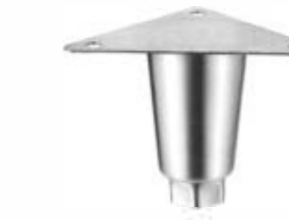
Item No.: ZG113122-4"

Material: stainless steel Height: 150-175mm