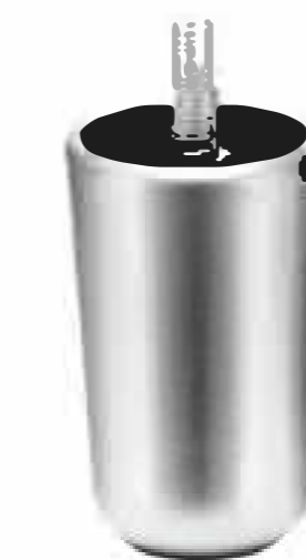
Item No.: ZG253

Material: SS #201 or #304 Bottom: zamak hex Height: 90~120mm