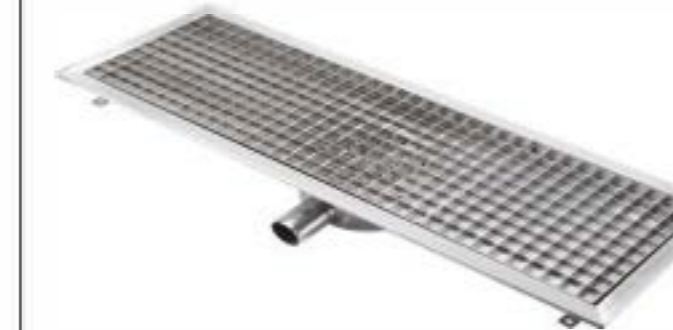
Item No.: BOOD-30120-2

Material: SS #201 / SS #304 Size: 90*30 mm