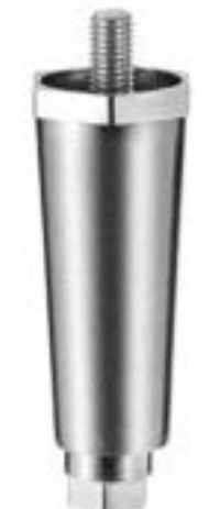
Item No.: Z7551

Material: Nylon Body and Zamak bottom Height: 4"(100mm)