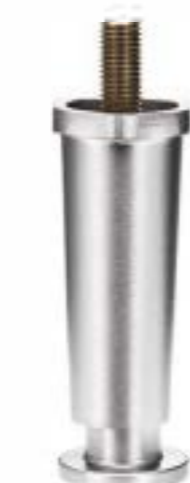
Item No.: Z7552