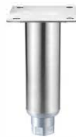
Item No.: D2011-Y41(L)

Material: Stainless steel + Zamak Bottom: 41mm round bullet foot insert