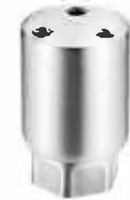
Item No.: A1252-01

Material: SS201/SS304 Tubing: φ50.8+42mm