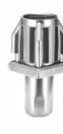
Item No.: DG4012-F38

Material: Aluminum Apply for 38*38mm square tube