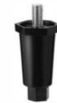
Item No.: ZG3533-2.5"