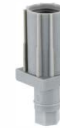
Item No.: DG1016-F30

Material: Grey Plastic Bottom with SS #201 or #304 clad Apply for 40*40mm square tube