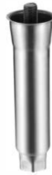
Item No.: A9(5+9)1

Material: SS201/SS304 in black painting Tubing: φ40+32mm