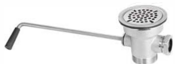
Item No.: SSD-02