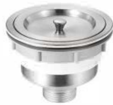
Item No.: SSD-04-1