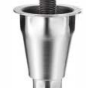
Item No.: Z2523-90

Material: stainless steel Height: 5"(120-150mm)