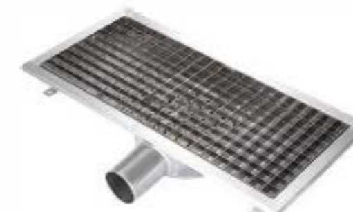
Item No.: BOOD-3060-2

Material: SS #201 / SS #304 Size: 30*30 mm