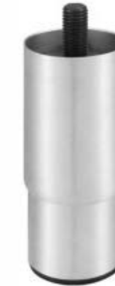
Item No.: A1152.5