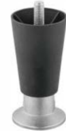
Item No.: ZG3552-02

Material: Nylon Body and Zamak Bottom Height: 4"(100mm)