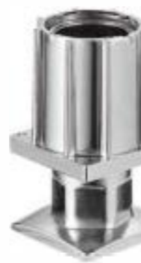
Item No.: F2212-F40(40)

Material: Black Plastic Bottom with SS #201 or #304 clad Apply for 40*40mm square tube