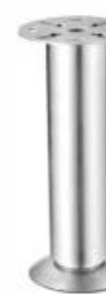
Item No.: FAL95

Material: Plastic in chroming Size: \phi 28mm, 145mm height