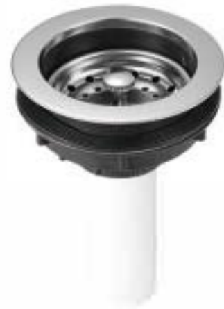
Item No.: SSD-03