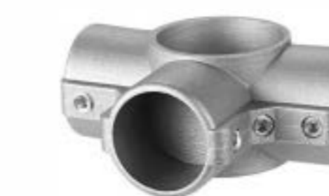
Item No.: T4331

Material: Alu Apply for \phi 41 mm round tube