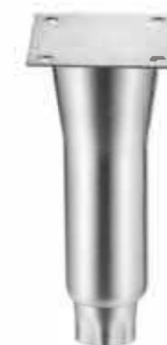
Item No.: A1(7+9)3

Material: SS201/SS304 Tubing: φ50.8+42mm