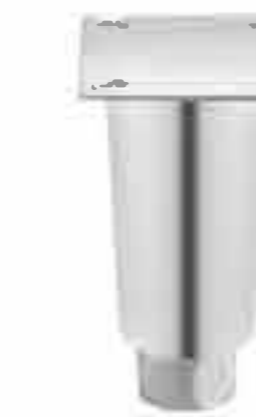
Item No.: ZG113122-6.5"

Material: stainless steel Height: 4"(90-120mm)