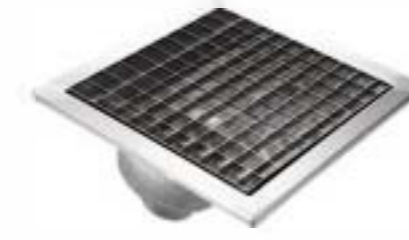
Item No.: BOOD-3030-1

Material: SS #201 / SS #304 Size: 30*30 mm