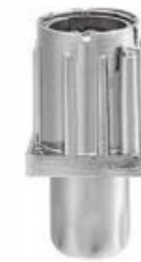
Item No.: D2212-F38

Material: Black Plastic Bottom with SS #201 or #304 clad Apply for 51*51mm square tube