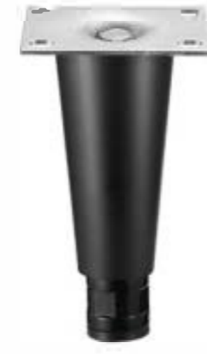
Item No.: Z3311

Material: Nylon Body and Zamak bottom Height: 6"(150mm)