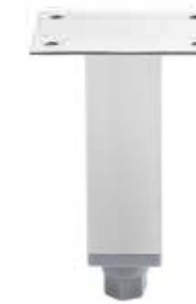
Item No.: D1016-F40(L)

Material: Stainless steel + Plastic Bottom: 41mm square bullet foot insert