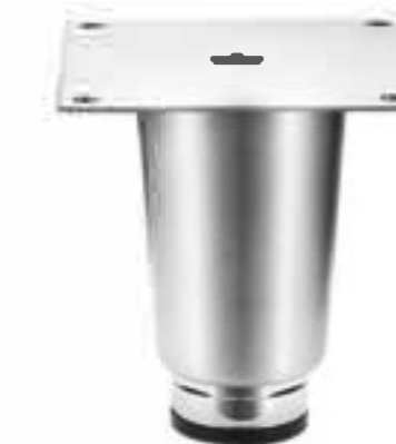
Item No.: ZG2152

Material: SS #201 or #304 Bottom: zamak hex