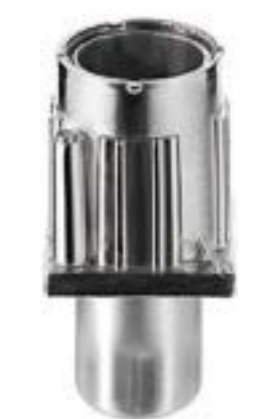
Item No.: D2212-F40

Material: Black Plastic Bottom with SS #201 or #304 clad Apply for 40*40mm square tube