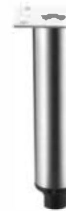
Item No.: D1011-Y51(L)

Material: Stainless steel + Zamak Bottom: 41mm round bullet foot insert