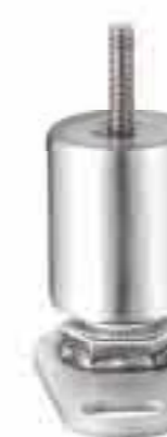
Item No.: A12533-45

Material: SS #304 Size: \phi 35mm, 145~165mm height