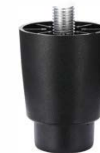
Item No.: ZG3533

Material: SS #201 or #304 Bottom: zamak hex Height: 90mm