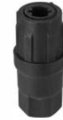
Item No.: DG1011-Y30

Material Black Plastic Apply for \phi 25mm round tube