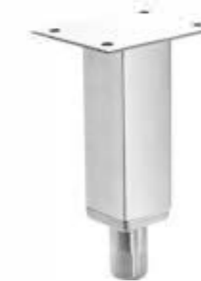
Item No.: D2111-F40(L)

Material: Stainless steel + Plastic Bottom: 41mm square bullet foot insert