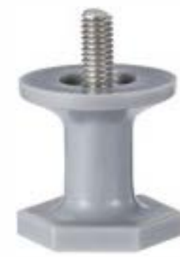
Item No.: TBF-01