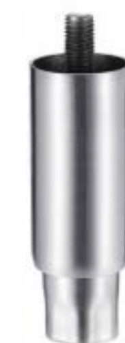
Item No.: A951