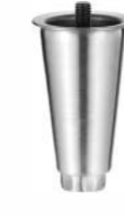
Item No.: Z1523-120

Material: stainless steel Height: 6"(150-180mm)