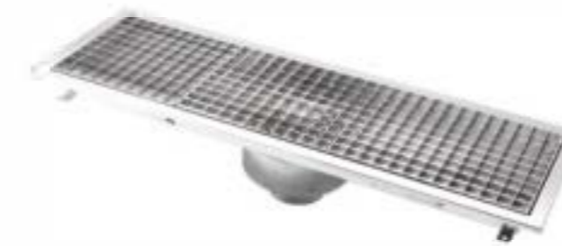
Item No.: BOOD-3090-1

Material: SS #201 / SS #304 Size: 60*30 mm