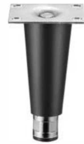
Item No.: Z3341

Material: Nylon Body and Zamak bottom Height: 6"(150mm)