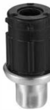
Item No.: D1111-Y41

Material White Plastic Bottom with SS #201 or #304 clad Apply for \phi 38mm round tube