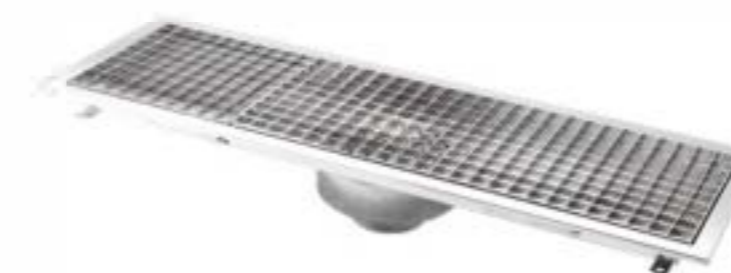
Item No.: BOOD-30120-1

Material: SS #201 / SS #304 Size: 90*30 mm