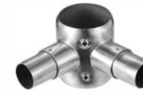
Item No.: T1121 / T1321

Material: SS #201 / SS #304 Apply for \phi 38/41 mm round tube