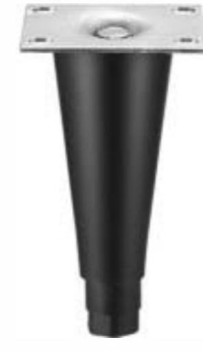
Item No.: Z3333

Material: stainless steel Height: 4"(90-120mm)