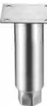
Item No.: A121

Material: SS201/SS304 Tubing: φ50.8+42mm