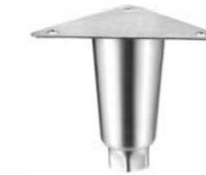
Item No.: ZG113122-6.5"

Material: stainless steel Height: 4"(90-120mm)