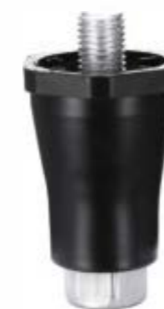
Item No.: ZG3532-4"

Material: SS #201 or #304 Height: 48~70mm