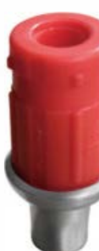
Item No.: D1119-Y41

Material Grey Plastic Bottom with SS #201 or #304 clad Apply for \phi 41mm round tube