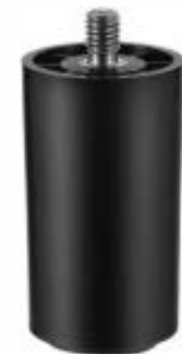
Item No.: FAL690