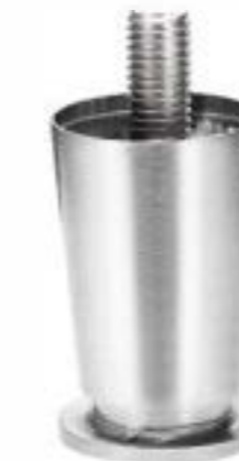
Item No.: ZG2522

Material: SS #201 or #304 Bottom: with SS #201 or #304 clad Height: 60~70mm