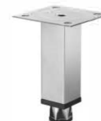
Item No.: D1211-F40(L)

Material: Stainless steel + Plastic Bottom: 41mm round bullet foot insert