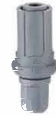
Item No.: DG1016-Y25

Material Red Plastic Bottom with SS #201 or #304 clad Apply for \phi 38mm round tube