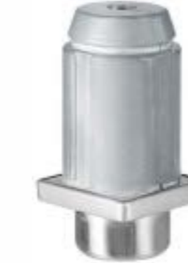
Item No.: D2111-F51

Material: Zamak Bottom with SS #201 or #304 clad Apply for 51*51mm square tube