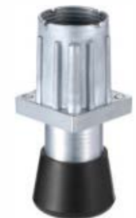
Item No.: D2021-F38

Material: Aluminum Apply for 38*38mm square tube