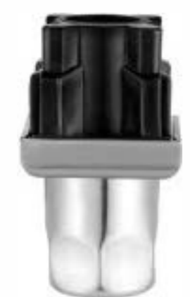
Item No.: DG1111-F51

Material: Zamak in Nickel Bottom with SS #201 or #304 Flange Apply for 38*38mm square tube