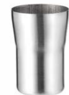
Item No.: J2100-100

Material: SS #201 / SS #304 Apply for \phi 38/41 mm round tube