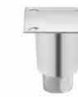
Item No.: ZG113122-4"

Material: stainless steel Height: 150-175mm