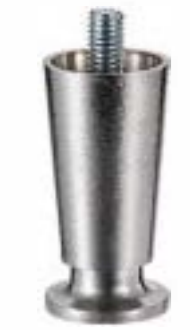
Item No.: ZG3551-2.5"