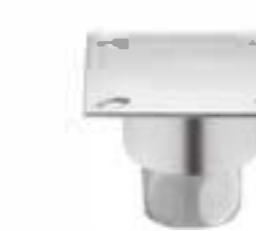
Item No.: ZG113122-2"

Material: stainless steel Height: 95-120mm