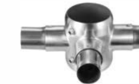
Item No.: T1131 / T1331

Material: SS #201 / SS #304 Apply for \phi 38/41 mm round tube