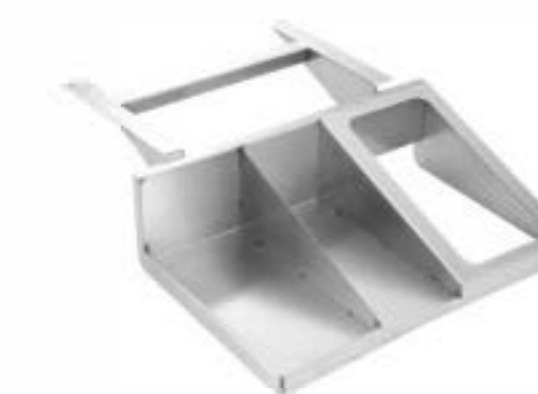
Item No.: S99812