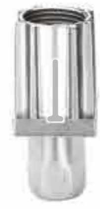
Item No.: DG4213-F38

Material: Zamak in Nickel Bottom with SS #201 or #304 clad Apply for 38*38mm square tube