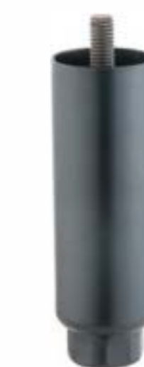
Item No.: A1513B

Material: SS201/SS304 Tubing: φ50.8+42mm