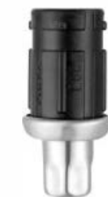
Item No.: D1111-Y38

Material Black Plastic Bottom with SS #201 or #304 clad Apply for \phi 38mm round tube