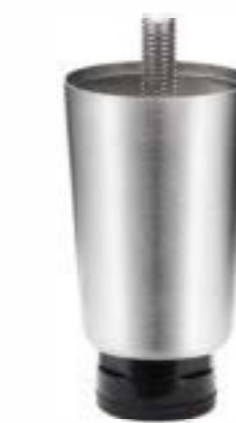
Item No.: ZG2552

Material: SS #201 or #304 Bottom: zamak hex