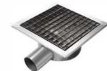
Item No.: BOOD-3030-2

Material: SS #201 / SS #304 Size: 120*30 mm