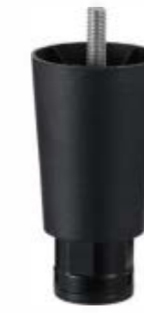
Item No.: ZG3533-4"