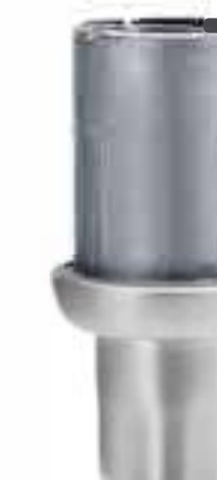
Item No.: D2111-Y38

Material: Iron+Aluminum Bottom with SS #201 or #304 clad Apply for \phi 38mm round tube