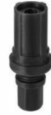
Item No.: DG1011-Y25

Material Black Plastic Apply for \phi 25mm round tube