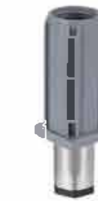
Item No.: D1216-F40(L)

Material: Blue Plastic Bottom with SS #201 or #304 clad Apply for 40*40mm square tube