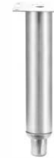
Item No.: D2111-Y41(L)

Material: Stainless steel + Zamak Bottom: 38mm round bullet foot insert