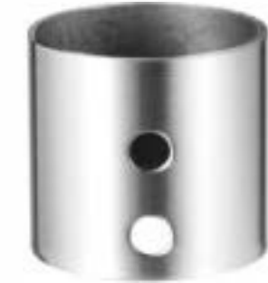
Item No.: J2112-40 / J1112-40

Material: SS #201 / SS #304 Apply for \phi 38/41 mm round tube