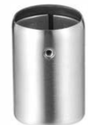
Item No.: J2311-80 / J1311-80

Material: SS #201 / SS #304 Apply for \phi 38/41 mm round tube