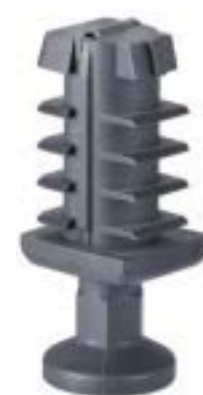
Item No.: FG1021-F30

Material: Plastic Size: \phi 50mm round tube