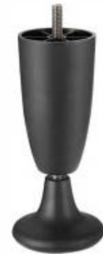
Item No.: FALZF01