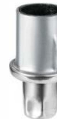
Item No.: DG5115-Y38

Material: Grey Plastic Apply for \phi 38mm round tube