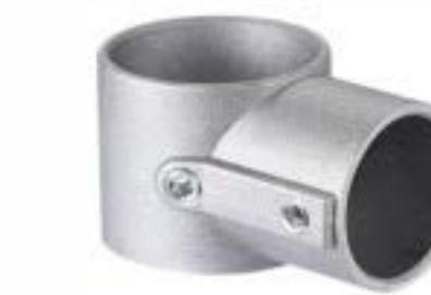
Item No.: T4311

Material: SS #201 / SS #304 Apply for \phi 38/41 mm round tube