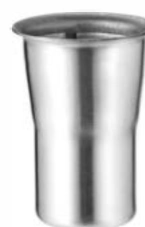
Item No.: J2400-100

Material: SS #201 / SS #304 Apply for \phi 38mm round tube