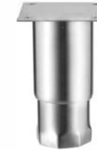
Item No.: A11215.6