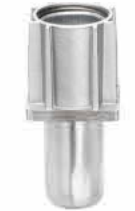
Item No.: DG4211-F38

Material: Zamak Bottom with SS #201 or #304 clad Apply for 38*38mm square tube