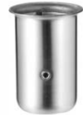
Item No.: J2211-80 / J1211-80

Material: SS #201 / SS #304 Apply for \phi 38/41 mm round tube