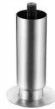
Item No.: A125401

Material: SS201/SS304 Tubing: φ32mm+ φ25mm