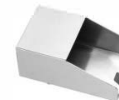
Item No.: I25-082