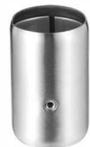
Item No.: J2311-80 / J1311-80

Material: SS #201 / SS #304 Apply for \phi 38/41 mm round tube