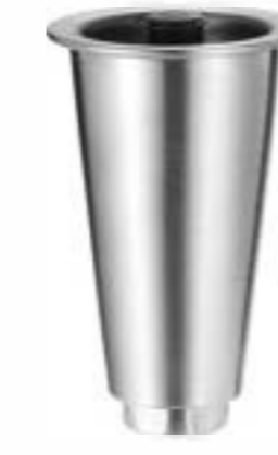
Item No.: Z1623-120

Material: stainless steel Height: 6"(150-180mm)