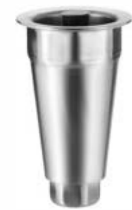
Item No.: Z2623-120

Material: stainless steel Height: 6"(150-180mm)