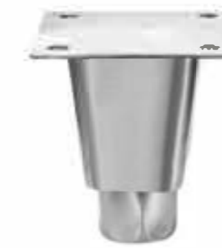
Item No.: ZG21333

Material: SS #201 or #304 Bottom: with SS #201 or #304 clad Height: 60~70mm