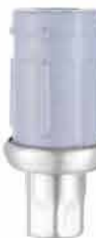
Item No.: D1116-Y41

Material Black Plastic Bottom with SS #201 or #304 clad Apply for \phi 41mm round tube