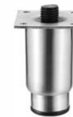
Item No.: A1 (1+5)1

Material: SS201/SS304 Tubing: φ50.8+42mm