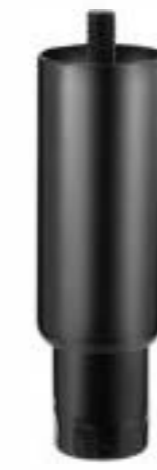
Item No.: A951B

Material: SS201/SS304 in black painting Tubing: φ40+32mm