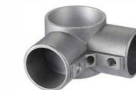
Item No.: T4321

Material: Alu Apply for \phi 41 mm round tube