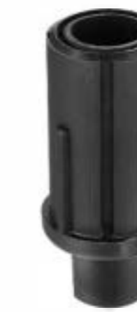
Item No.: DG1011-Y41

Material: Black Plastic Apply for \phi 43mm round tube