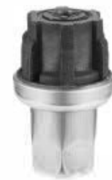
Item No.: DG1111-Y38

Material Black Plastic Apply for \phi 30mm round tube