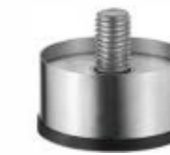
Item No.: A1352