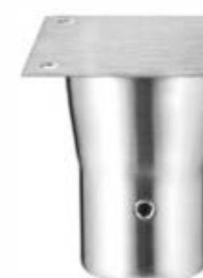
Item No.: J1611-80

Material: SS #201 / SS #304 Apply for \phi 41 mm round tube