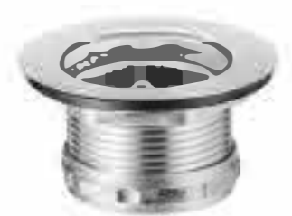
Item No.: SSD-06