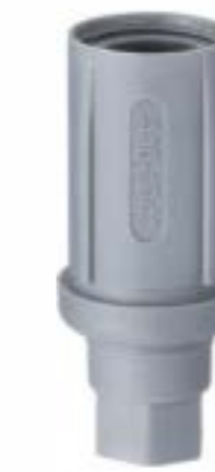
Item No.: DG1016-Y38

Material Black Plastic Apply for \phi 38mm round tube