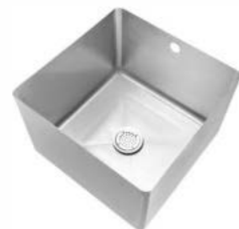
Item No.: WS-01

Material: SS #201 / SS #304 Size: Customized