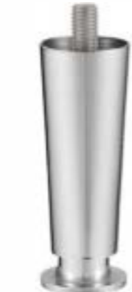
Item No.: Z6552-02