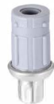
Item No.: D1116-Y38

Material Black Plastic Bottom with SS #201 or #304 clad Apply for \phi 38mm round tube