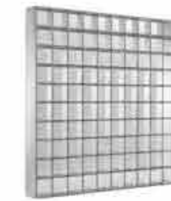
Name.: SS Grate