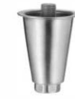
Item No.: Z1523-90

Material: stainless steel Height: 5"(120-150mm)