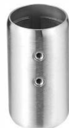
Item No.: J2312-80 / J1312-80

Material: SS #201 / SS #304 Apply for \phi 38/41 mm round tube