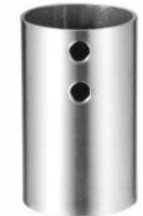
Item No.: J2112-70 / J1112-70

Material: SS #201 / SS #304 Apply for \phi 38/41 mm round tube