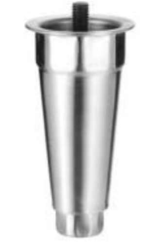
Item No.: Z2523-150

Material: Nylon Body and Nylon bottom Height: 6"(150mm)