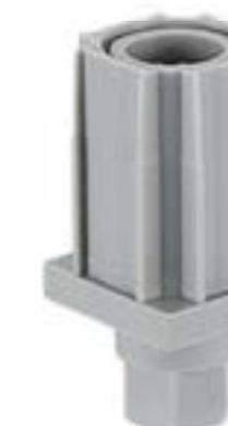
Item No.: DG1016-F35

Material: Grey Plastic Bottom with Flange Apply for 30*30mm square tube