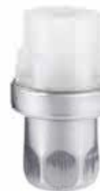
Item No.: DG1117-Y38

Material Black Plastic Bottom with SS #201 or #304 clad Apply for \phi 30mm round tube