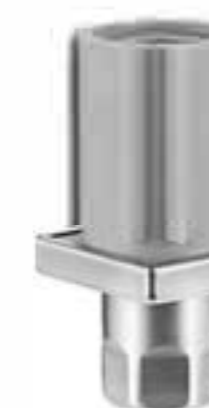
Item No.: DG1116-F40

Material: Grey Plastic Apply for 40*40mm square tube