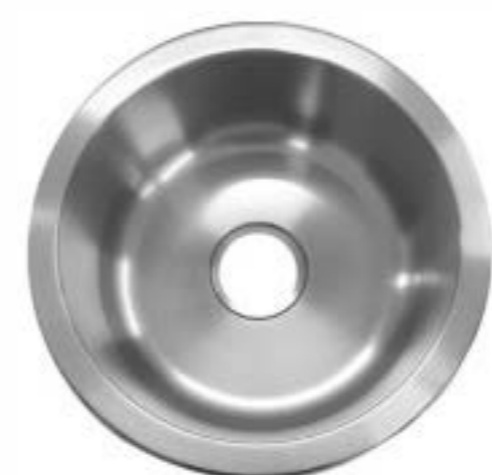
Item No.: MSR-01

Material: SS #201 / SS #304 Size: Customized