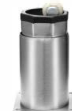
Item No.: A11215.5C