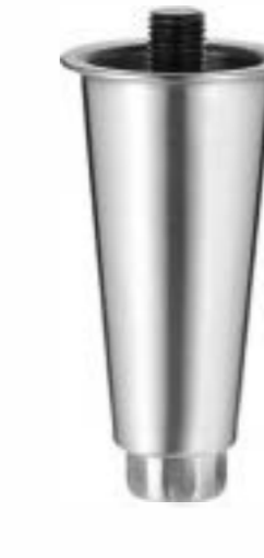
Item No.: Z1523-150

Material: stainless steel Height: 55-65mm