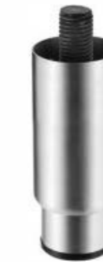
Item No.: A152

Material: SS201/SS304 Tubing: φ50.8+42mm