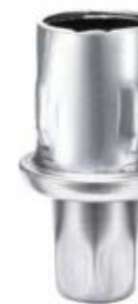
Item No.: DG5115-Y41

Material: Iron Bottom with SS #201 or #304 clad Apply for \phi 38mm round tube