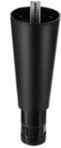
Item No.: Z3511

Material: Nylon Body and Zamak bottom Height: 6"(150mm)