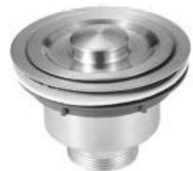
Item No.: SSD-04-2