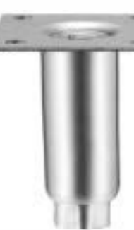
Item No.: A111

Material: SS201/SS304 Tubing: φ50.8+42mm