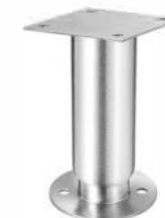
Item No.: A933