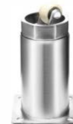
Item No.: A11215.6C