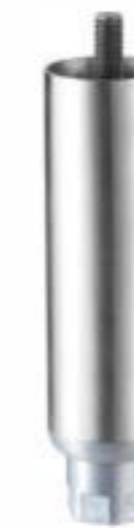
Item No.: D2011-Y41(L)

Material: Plastic Size: \phi 40mm square tube