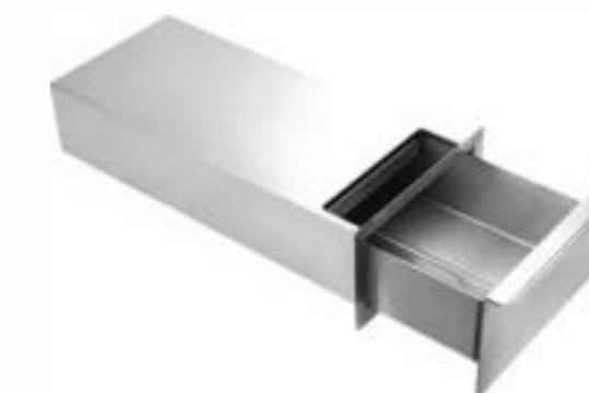
Name.: SS Drawer