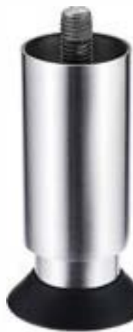
Item No.: A1510

Material: SS201/SS304 Tubing: φ50.8+42mm