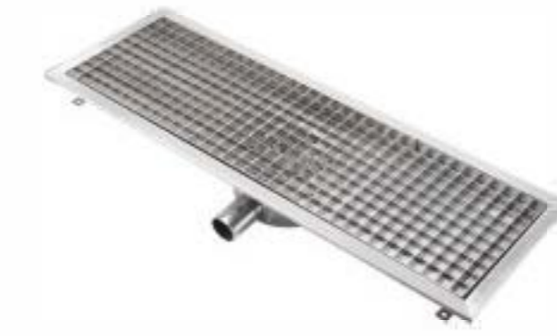
Item No.: BOOD-309 0-2

Material: SS #201 / SS #304 Size: 60*30 mm