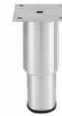
Item No.: A922