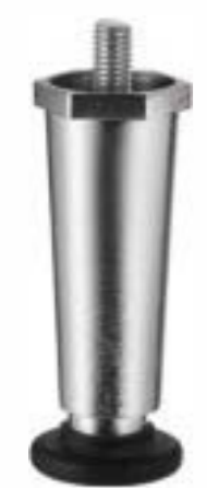
Item No.: Z7552-04