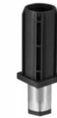
Item No.: D121X-F40(L)

Material: Grey Plastic Bottom Iron Apply for 40*40mm square tube