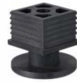
Item No.: FG1021-F50

Material: Plastic Size: \phi 40mm square tube