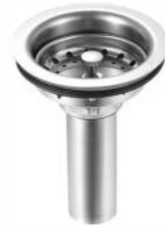
Item No.: SSD-07