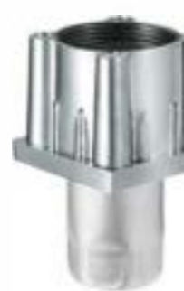
Item No.: DG4213-F51

Material: zamak in nickel Bottom with SS #201 or #304 flange Apply for 40*40mm square tube