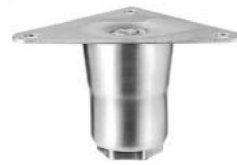
Item No.: A1(1+9)1

Material: SS201/SS304 Tubing: φ50.8+42mm