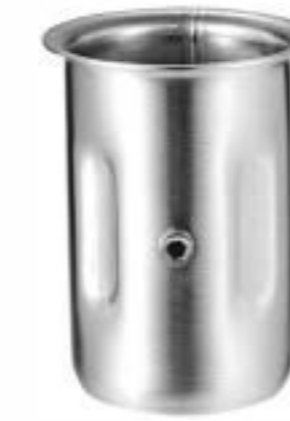
Item No.: J1401-80

Material: SS #201 / SS #304 Apply for \phi 41 mm round tube