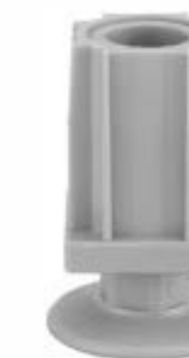
Item No.: FG1016-F40

Material: Grey Plastic Bottom with #304 clad Apply for 40*40mm square tube