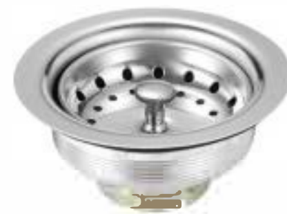
Item No.: SSD-05