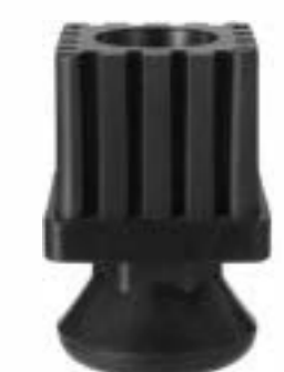
Item No.: FG1021-F40

Material: Plastic Size: \phi 30mm square tube