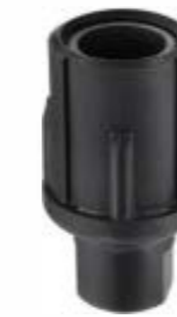
Item No.: DG1011-Y38

Material Black Plastic Apply for \phi 38mm round tube