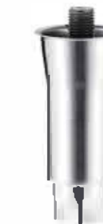
Item No.: A1(5+9)1

SS201/SS304 in black painting Tubing: φ50.8+42mm