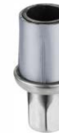
Item No.: DG4111-Y38

Material: Grey Plastic Apply for \phi 41mm round tube