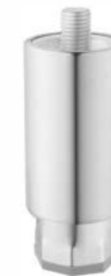
Item No.: A1152.8