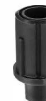
Item No.: DG1011-Y51

Material: Zamak Bottom with SS #201 or #304 clad Apply for \phi 41mm round tube