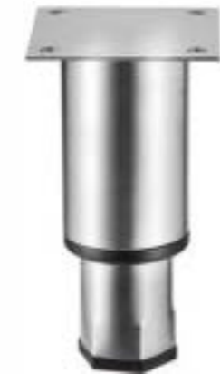
Item No.: A121217

Material: SS201/SS304 Tubing: φ50.8+42mm